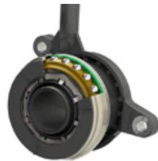
BAD release bearing